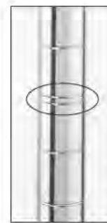
SiteSelect Posts feature double grooves every 8" (203mm) to aid assembly.