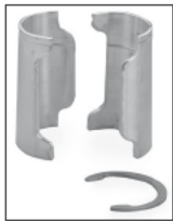
Aluminum Split Sleeve