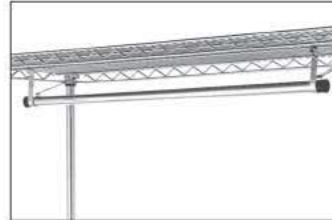
Garment Hanger Tube with Brackets

Weight capacity — 75 lb. (34kg) evenly distributed. *Also works with 30" (760mm) and 36" (914) width shelves.