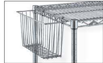
Large Display/Storage Basket