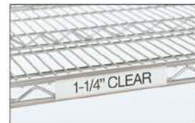
Clear Label Holder