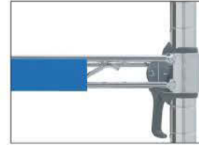
Color Shelf Markers