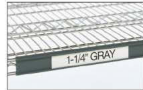
1 1 / 4 " (32mm) Label Holder