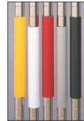
Color ID Tubes