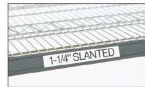
Slanted Label Holder