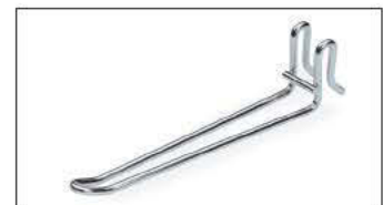
Extension Display Hanger